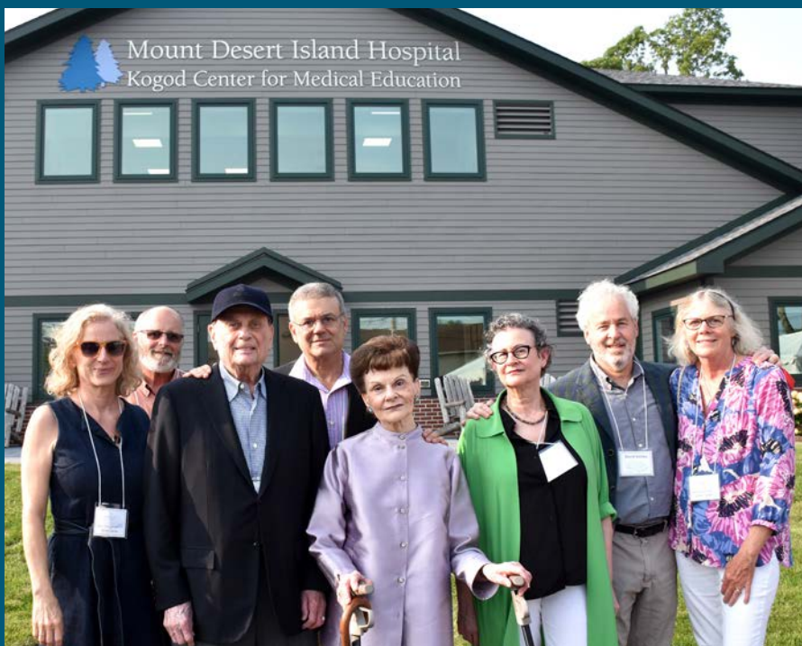
Kogod family members and friends visit the Kogod Center for Medical Education at MDI Hospital