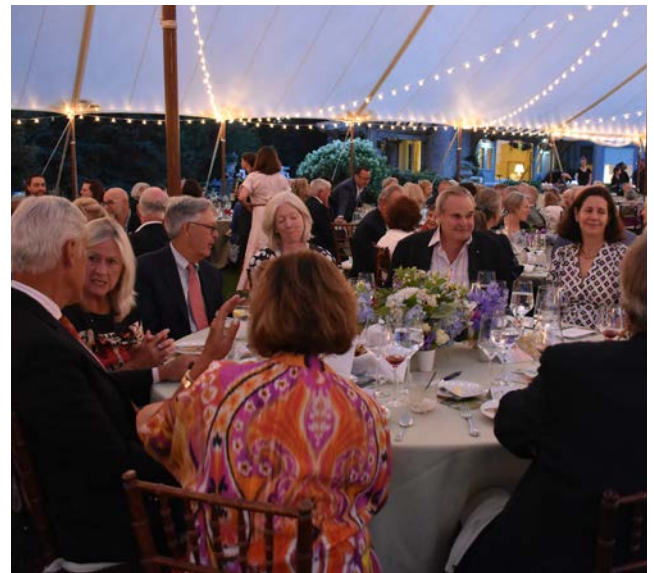
Guests enjoying dinner under the tent overlooking the Breakwater