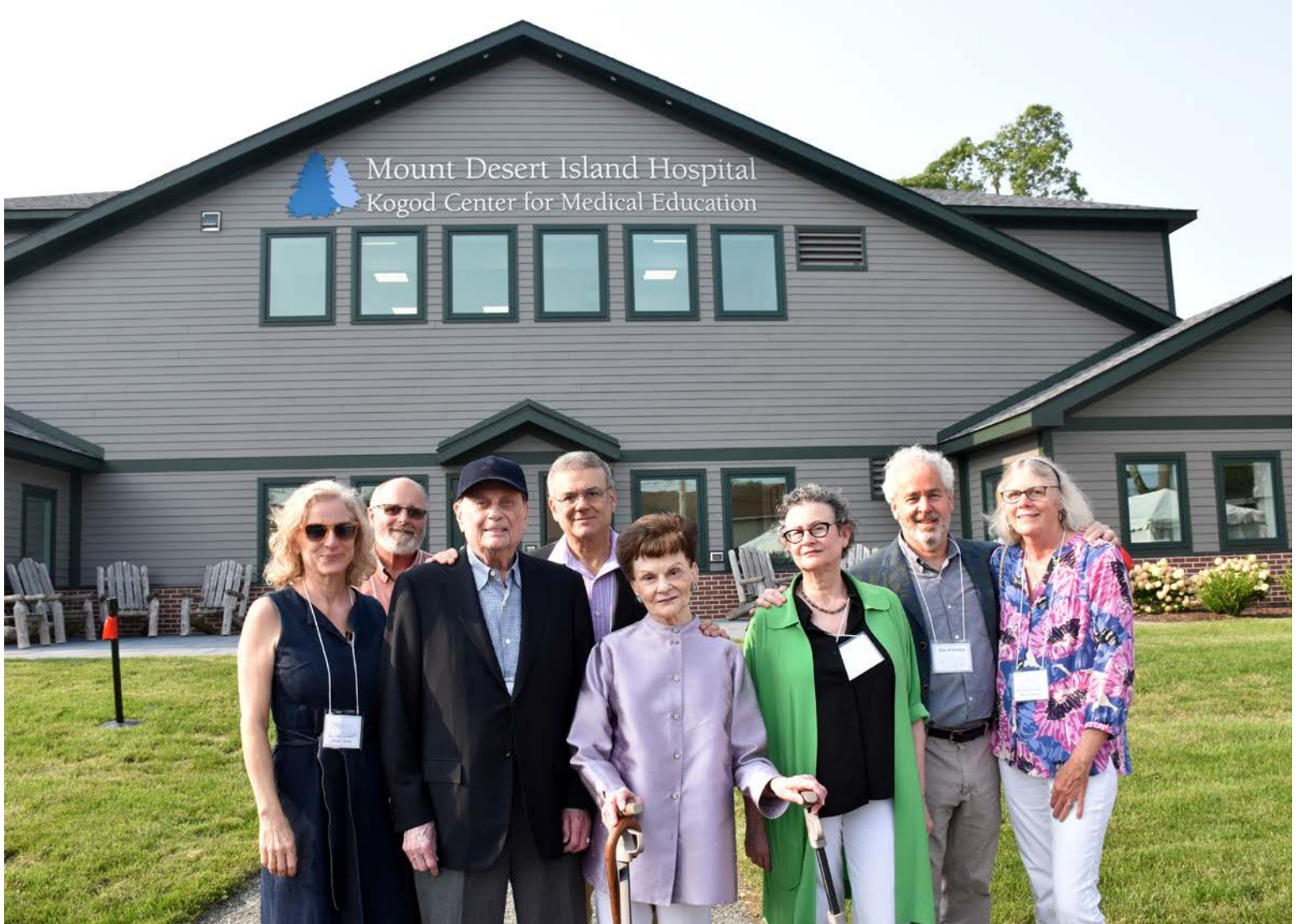
Kogod family members and friends visit the newly opened Kogod Center for Medical Education